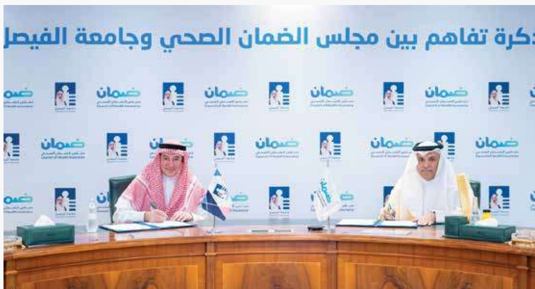
Alfaisal University partners with the Saudi Health Council and the Council of Cooperative Health Insurance to advance healthcare initiatives, 2024.