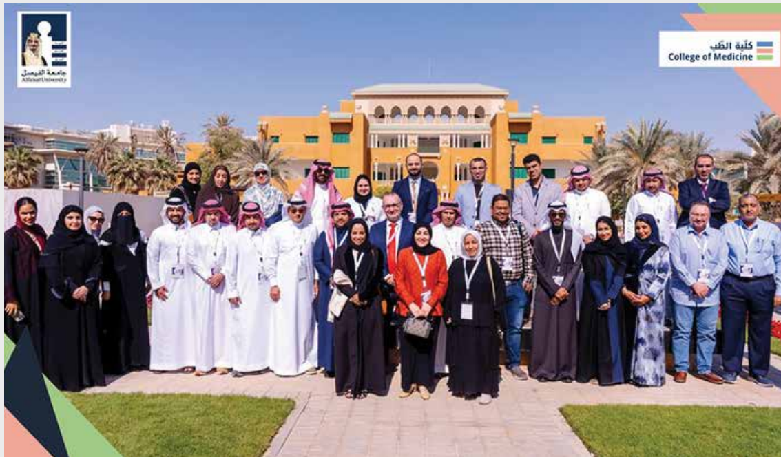
Alfaisal University and Sanofi collaborate in advancing education and research, including hosting the 2025 Type 2 Inflammation Preceptorship for clinicians

The private sector and the pharmaceutical industry have also participated in the Center's training programs. In the fourth quarter of 2025, the Center organized a specialized training course for consultants from Saudi Arabia and the Gulf region on the optimal healthcare management of chronic respiratory infections, sponsored by Sanofi Pharmaceutical and Healthcare Company, contributing to the exchange of expertise and the enhancement of clinical and professional practices.