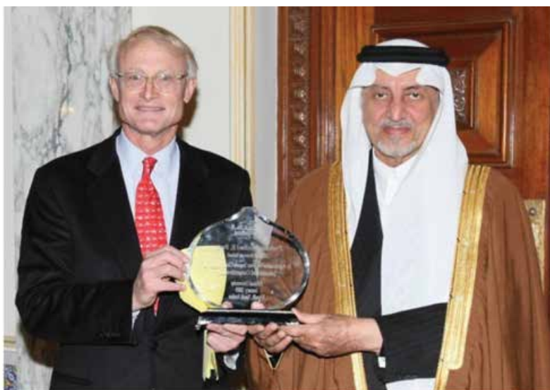
HRH Prince Khalid Al Faisal Bin AbdulAziz Al-Saud, Board of Trustees Chairman, Professor Michael E. Porter, Harvard Business School Professor and Founder of the Value-Based Health Care Model, 2011.

Delivered through an internationally relevant curriculum tailored to Saudi healthcare policy, and supported by expert faculty and collaborative research, the program is strengthened by the Health Economics Center at Alfaisal University -one of the leading centers in the field- dedicated to advancing efficiency, quality, and evidence-based decision-making in healthcare systems.